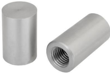
THS625-TC25x50-M16 according to DIN EN582

*Further dimensions according to standards on request