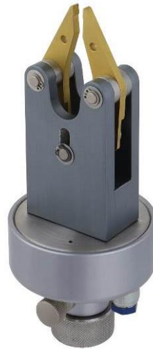
THS501+BP-TiN Jaws with titan nitride coating