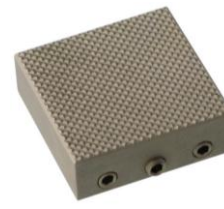
Item no.: TH240k-BP Pyramid (serrated) jaws