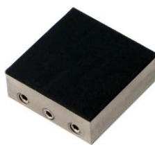
Item no.: TH240k-BG Rubber-coated jaws