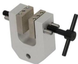
Item no.: TH240k Small vice grip See TH240k Datasheet.pdf