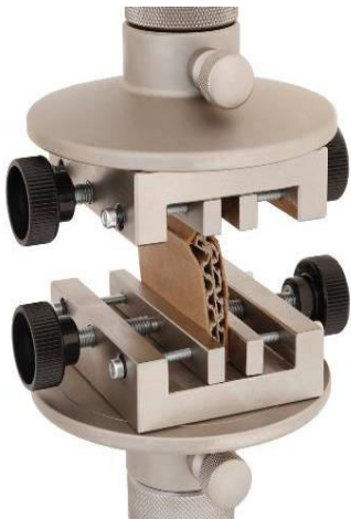
Item no.: THS1158-75-ASTM-C364

150 kN hydraulic rope grip with hydraulic rod spring return for samples 5-20 mm Ø