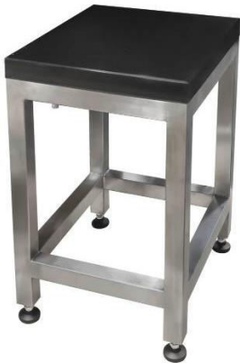
Item no.: TH3935-560x470x780

Black granite table for accurate measurement Stainless steel stand, overall height 780 mm Plate: 560x470x50 mm (LxWxH)