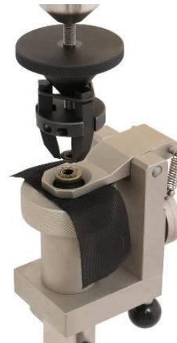
Item no.: THS1042-30 + THS807-d6

Compression test fixture according to ASTM C364 to test edgewise compressive strength of sandwich constructions